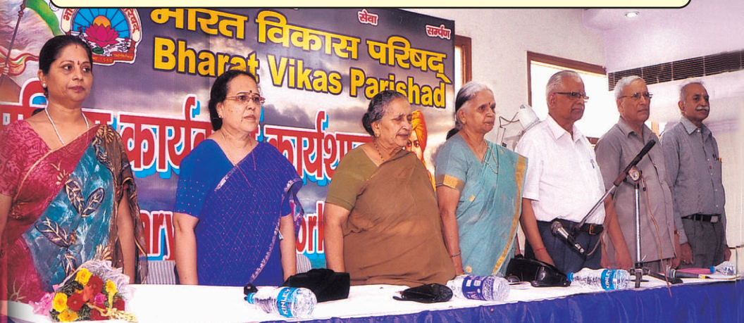
First All India Workshop for Mahila Karya Kartas at Delhi (August, 2011)